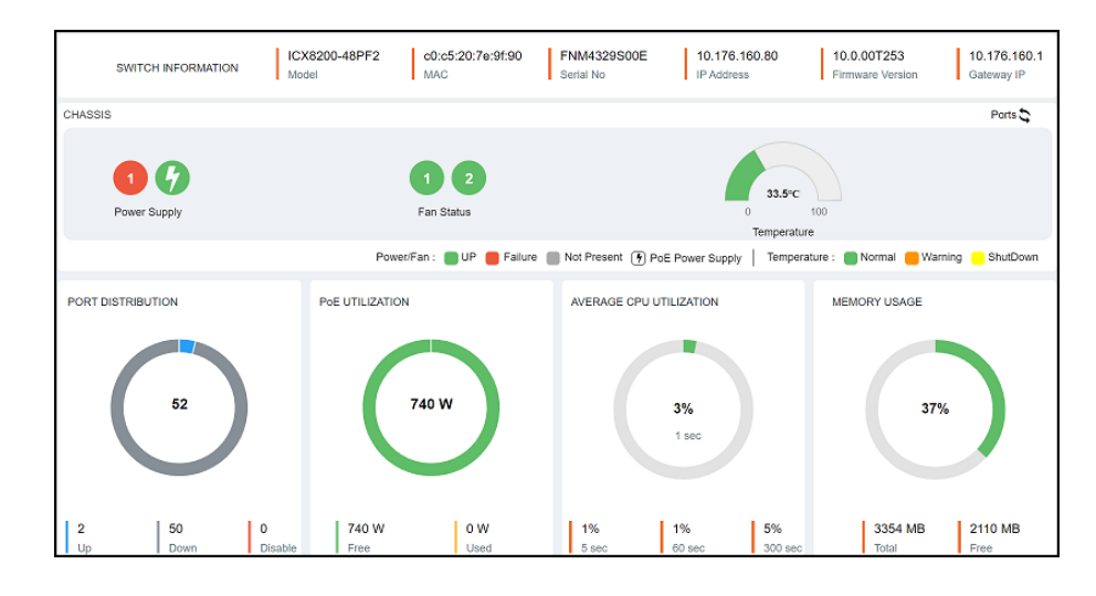
FIGURE 6 Dashboard: Chassis Panel

The following table lists the infographic elements of the Dashboard that provide the basic device information and its operational status and statistics.