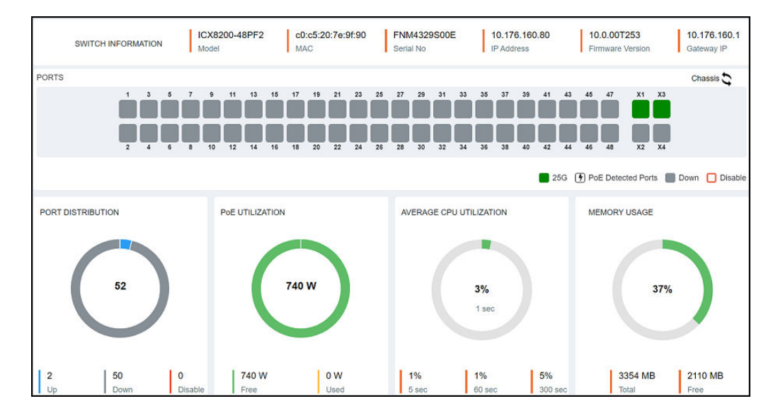
FIGURE 5 Dashboard: Ports Panel

By default, the Dashboard is in Ports panel. Click on Chassis Icon Chassis to switch to Chassis panel and click on Ports Icon Ports to switch to Ports panel.